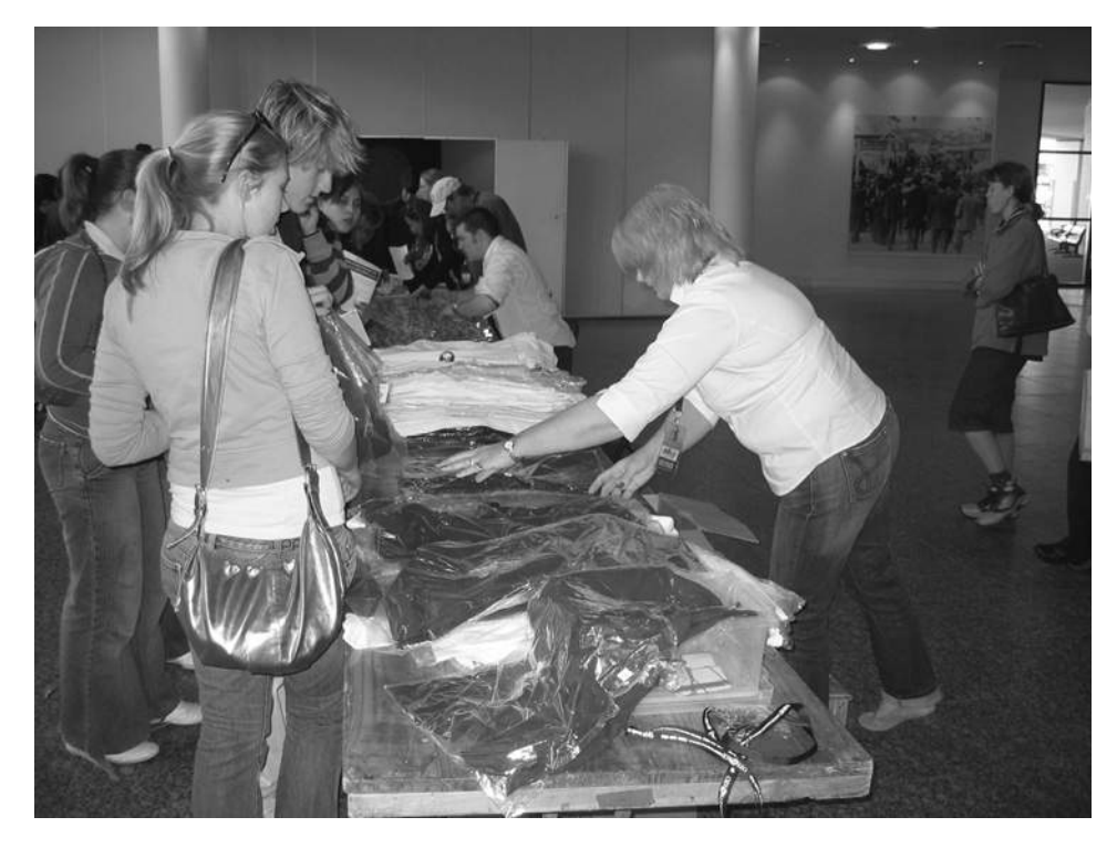
Issuing uniforms to volunteers

The process of recruitment and selection is illustrated in Figure 8.1. As this shows, once candidates have been sourced, they are selected against the criteria established in the person specification in a competitive process which identifies the best person or people for the job. Interviews are conducted, often by human resources personnel, and then by the direct supervisor. For very senior critical roles, such as artistic director, there is often a panel interview. Following this, references are checked and, for some events, a police check is done for accreditation purposes. Finally, the successful candidate is sent an offer letter which spells out the terms and conditions of their employment. It is also essential that unsuccessful candidates are advised in a timely manner.